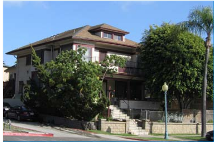
TURNING POINT HOME

The Turning Point Home was founded in 1970 by a small group of dedicated individuals who were concerned about the lack of resources in our community for alcoholic women. Since that time more than 1,500 women have received help at Turning Point. The program has evolved and developed over the years with alumni coming back to attend meetings, participate in our alumni association, sponsor current residents and serve on the Board of Directors.